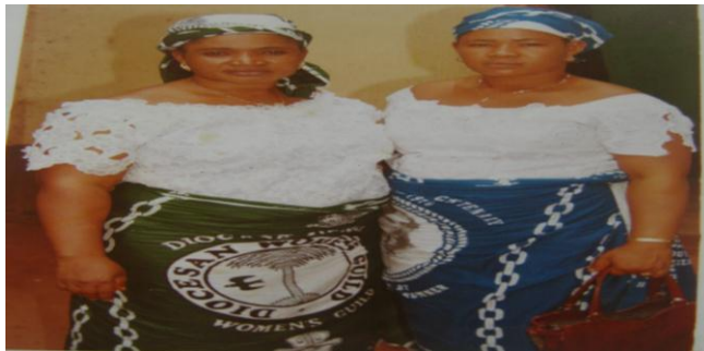
Plate 9: Anglican Mothers' Union general uniform in blue colour and Women's Guild in green colour.

According to Mothers' Union Manual in the Anglican Communion (2007), Mothers' Union and Women's Guild are the Ministries in the Church. The Mothers' Union started appearing in national uniform in 1976. According to Anglican Church Constitution (1990) of the Mothers' Union, the national uniform has the image of Mary Sumner and other relevant symbolic patterns printed on the design, (plate 9).