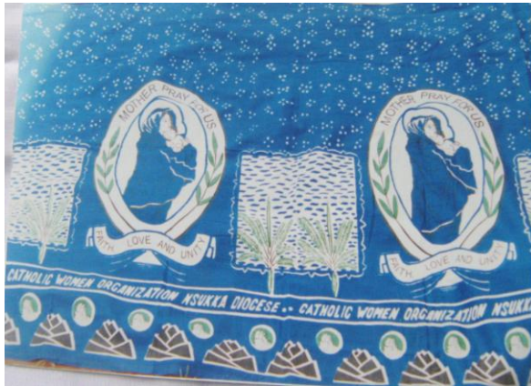
Plate 2: Sample of the uniform of C.W.O. Nsukka Diocese. Designed in two colours; Blue, purple on white back ground.

The Catholic Women Organization (C.W.O) uniform for Nsukka diocese has the background fabric in blue and white colours. Its motifs are stars designed in white colour and arranged in all-over repeat pattern. The picture of Mary carrying the baby Jesus is printed on it, with the messages such as ‘Mother Pray for Us’; ‘Faith, Love and Unity’ (plates 2 and 3)