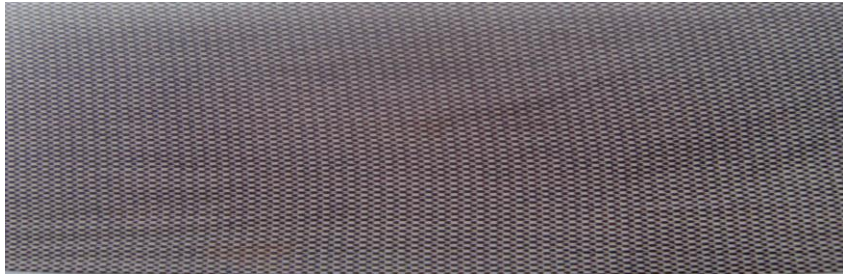
Plate 5: Presbyterian Women's Guild Uniform: Nkpuruoka fabric. Designed in one colour; Blue on white background.

is produced in light blue colour. This design is worn during regular meetings of the group. The Nkpuruoka design is also worn at the burial of members of the Guild. The guild also has the third uniform which is yellow colour version of the Nkpuruoka design, (plate 5). This fabric is worn by a member officiating on Sunday at service or worship. The yellow fabric is also worn at baptism and confirmation ceremonies of children. It was designed to celebrate the golden Jubilee of Presbyterian Women's Guild in Nigeria in 2002. One hundred and fifty thousand meters of this fabric was commissioned for production of this uniform by the church at the first instance.