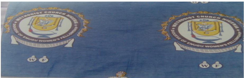
Pate 8: Uniform of Methodist Women's Fellowship. Diocese of Enugu.