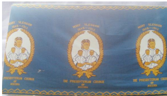
Plate 4: Sample of the Presbyterian Women's Guild uniform. Designed in two colours; Blue and yellow on white background.

The ministry of women in the Presbyterian Church is called Women's Guild. Mary Slessor who stopped the killing of twins is the founder of the Guild. Membership of the Church qualifies a woman to become a member of Women's Guild whether married or not married. A person is accepted as a member after passing through a study class. The Women's Guild has three different uniforms. They have the uniform with an artist's impression of Mary Slessor carrying twin babies, (plate 4). The design is printed in blue, white and yellow colours. To immortalize Mary Slessor, the founder of this organization, the uniform is worn only on mothering Sunday.