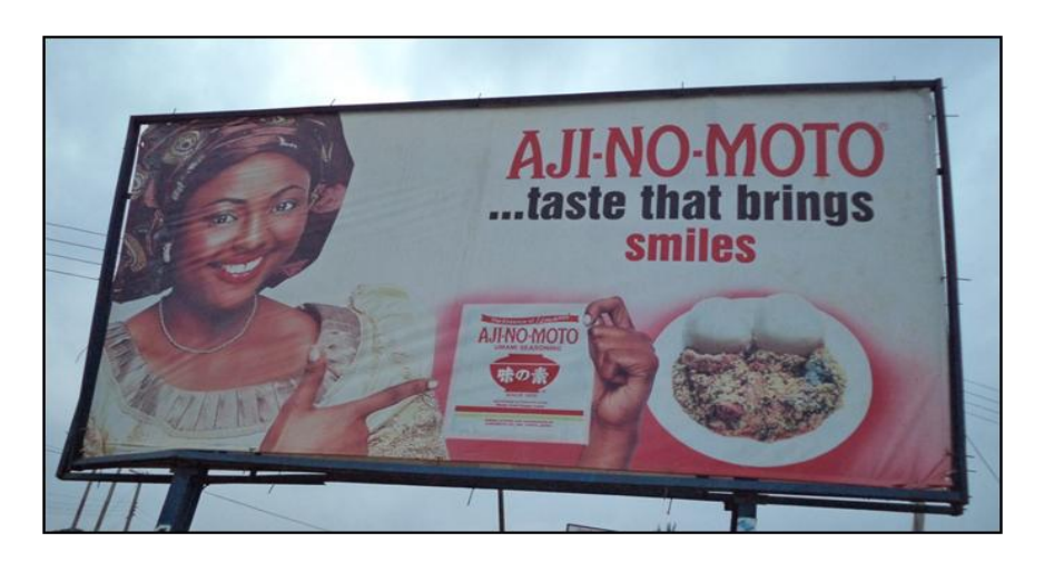
Plate 5. Aji-No-Moto, a bill board site