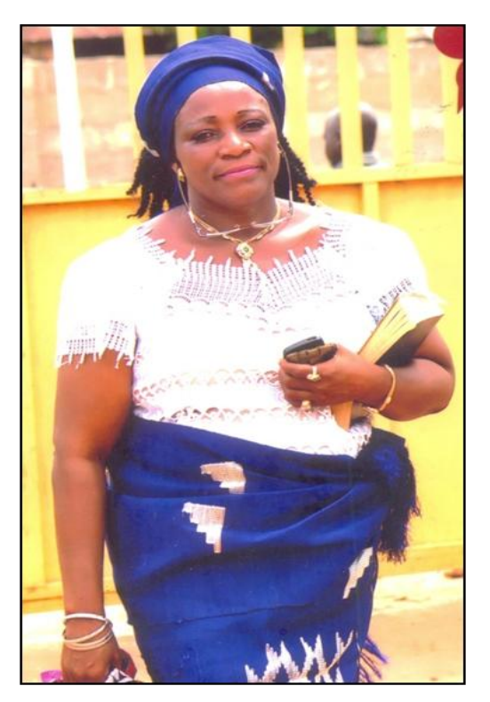
Plate 6. Eggon Woman