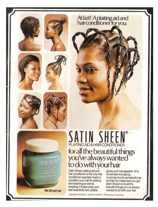
Plate 3. Satin Sheen hair product Photo Lintas 50 years still growing