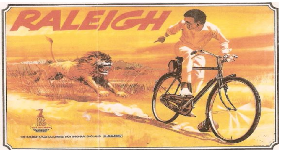
Plate 2. Raliegh Bicycle, Photo Lintas 50 years still growing