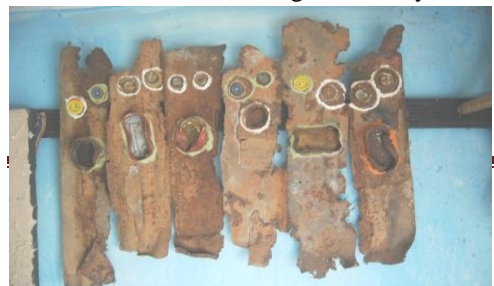
Fig. 5: After the Race, 2010, Corrugated Iron Sheets, empty tins of canned food and acrylic colours