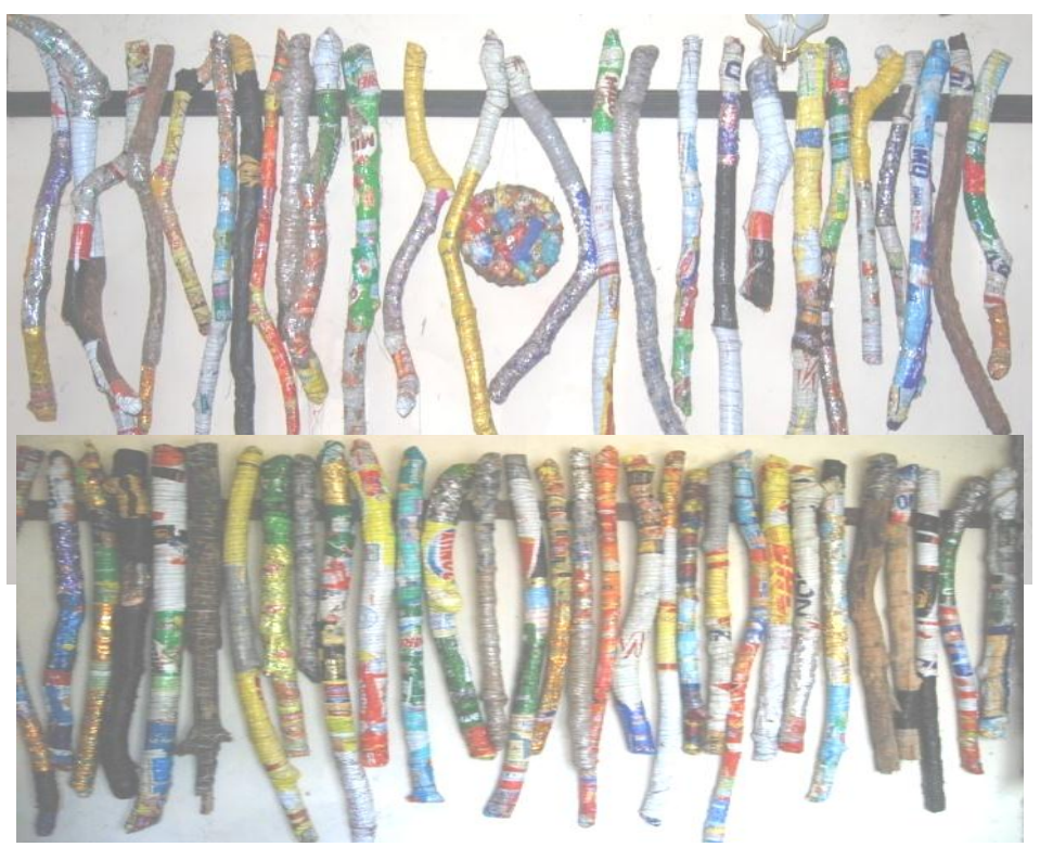
Fig. 2: Pie Group , 2011, Wood, nylon threads, empty sachets of "pure water", biscuits/Indomie/detergent wrappers, polythene and aluminium foils