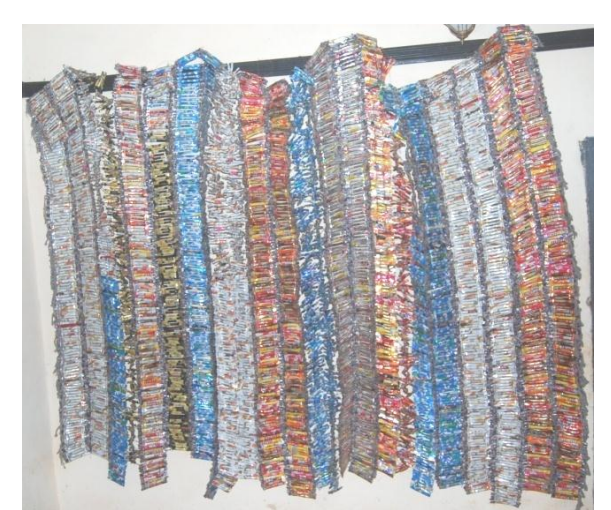
Fig.3a: One Mat, Many Strips, 2010, Empty cans of drinks, empty sachets of "pure water", cotton and copper wire.

Part of the power of Olanrewaju's assemblages arises from his mingling with familiar materials that readily concur with his idea to yield rhetoric unities of vigorous visual forms. His Mat series (which he also calls Goody-Goody series) carry rich associations of sweet and sour. One Mat, Many Strips (Figures 3a-3c) and Lonely Thought (Figure 4) look like broad multi-coloured hand-made mats. Also, due to their sweet-shaped elements of harmonized soothing colours, patterned after a rug, they vividly suggest comfort and satisfaction. On the other hand, to some viewers, it goes beyond recalling sweet feelings to implying tiredness as well as a desire for rest. In executing One Mat, Many Strips , Olanrewaju drafted discarded empty cans of drinks, which he cut in pieces and fashioned them into forms that look like wrapped "goodygoody" (a brand of chocolate sweet). Those forms became the physical elements the artist used to construct the visual metaphor that he charged with emotional feelings.