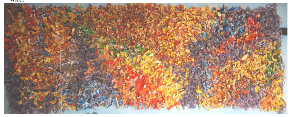
Fig. 4: Lonely Thought , 2010, Empty sachets of "pure water" and biscuits/Indomie/detergent wrappers on chicken mesh.