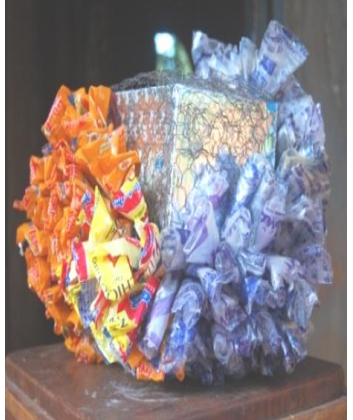
Fig. 7: Communication Gap, 2011, Used GSM recharge cards, chicken mesh, copper wire and empty fruit juice paper packets.