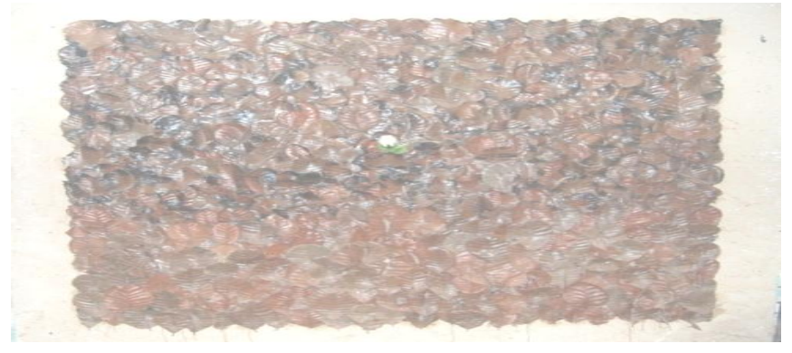
Fig. 10: Great Site , 2009, Dry cashew leaves, artificial flower, sand and earth pigments on canvas.