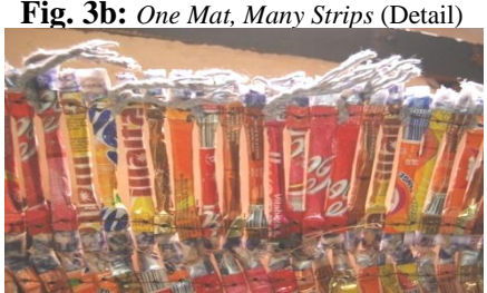
Fig. 3c: One Mat, Many Strips (Detail)