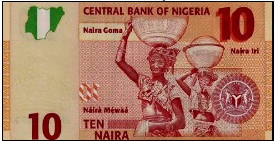
Fig. 4b: Ten Naira, 2007