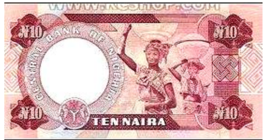
Fig. 4a: Ten Naira Note, 1979, 1984

Fig 3: Five Naira Note, 1973