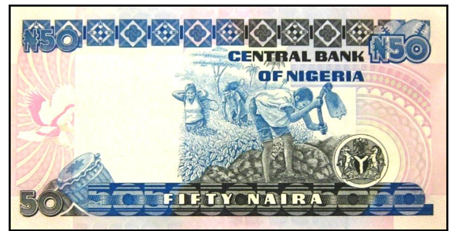
Fig. 5: Fifty Naira Note , 1991