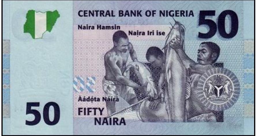
Fig. 8: Fifty Naira, 2007

For better presentation and understanding of the design contents, the notes are briefly described each. The Fifty kobo note of 1973 was designed using appropriate design elements and principles of art, and it became the only kobo denomination to appear as note. At the obverse of this note is a dominant design image of two human male figures barely clothed. Popularly recognized as lumberjack, these figures are captured as sawing and working on timbers.