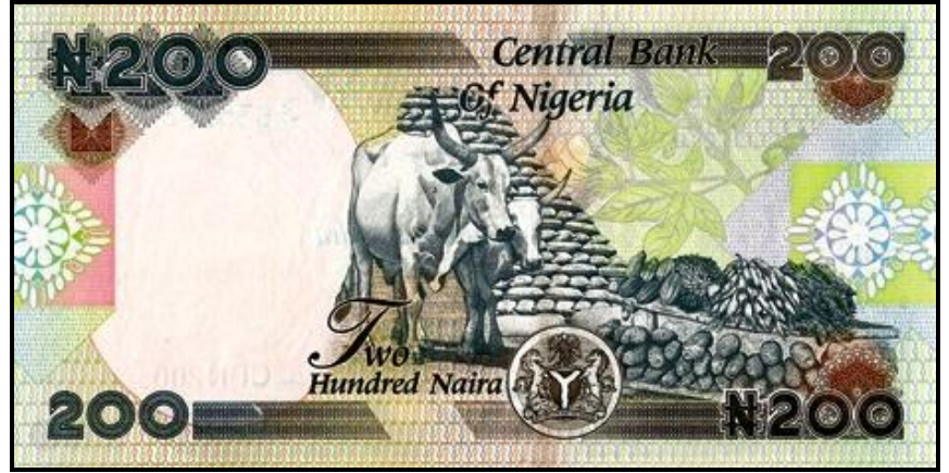
Fig. 6: Two Hundred Naira, 2000