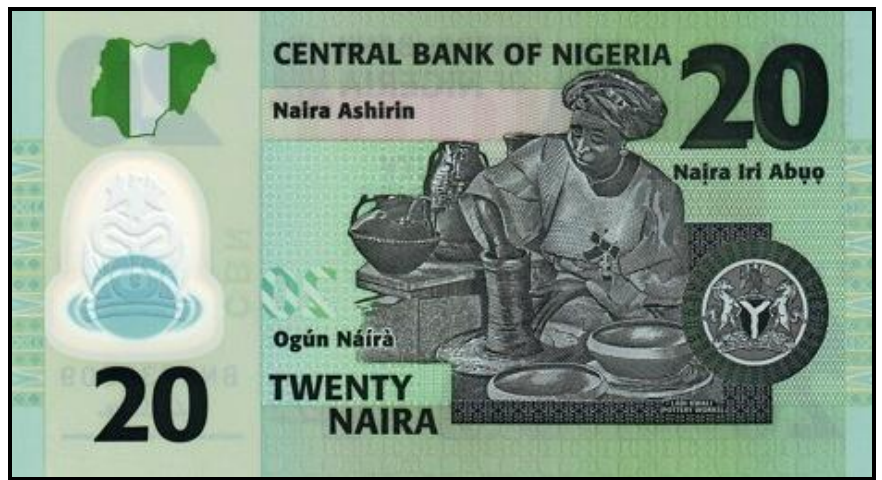
Fig. 7: Twenty Naira, 2007