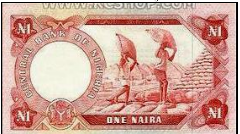
Fig 2: One Naira Note, 1973