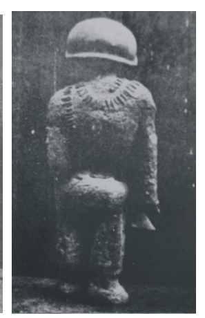
Fig. 2: Demas Nwoko, Soja Come, Soja Stay, Soja Go, 1968, terracotta.