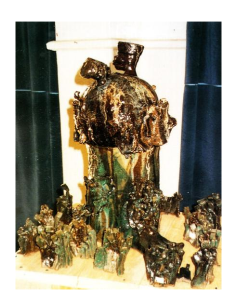
Fig.8: Saibu Alasan, Which way Forward? 1980s, glazed stoneware, variable installation