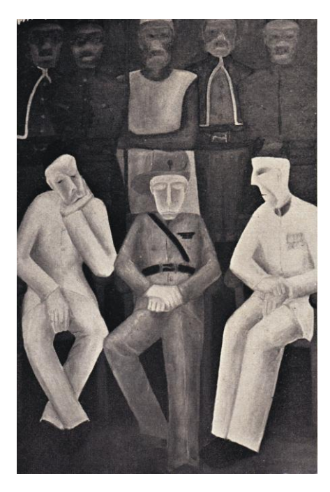
Fig. 1: Demas Nwoko, Nigeria in 1959

his paintings (as evident in his landmark piece, Nigeria in 1959 [Figure 1]) but also in the terracotta experiments of his early post-Zaria years of the 1960s.