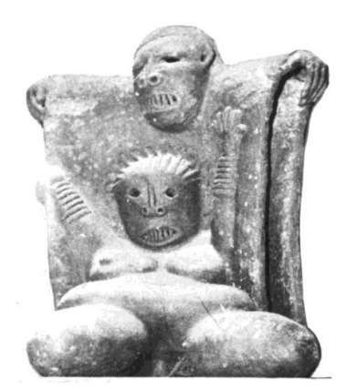
Fig.3: Demas Nwoko, Dancers , terracotta, 1960s.

Nwoko's Soja apparently addresses the transience of political power (as encapsulated in the popular aphorism "soldier go; soldier come"). The work is a witty commentary on the military coups of the 1960s in Nigeria. Similarly, Nwoko's Dancers (Fig.3) tends to address the frivolous social and economic lifestyles of the first republic politicians which gave rise to the intervention by the military. Dancers show a heavily-built male figure in large, flowing agbada (a robe emblematic of Nigerian politics and politicians) dancing with both arms outstretched behind an equally heavily built female figure reclining at his feet, also in an outlandish dancing pose. The female figure, sturdy and apparently overfed, rests backwards with outstretched arms across the man's large gown. The man's face is strategic. His nostrils are open and large; his chins fat and his mouth wide open, exposing rows of teeth that resemble those of a beast. Dancers can be read as Nwoko's satire on the socio-economic disposition of the typical Nigerian politician.