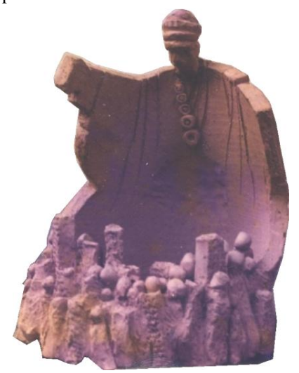
Fig.7: Chris Echeta, Politician I 1979, terracotta, ht. 29.5cm.

Which Way Forward? (Figure 8). Similar concerns are expressed in Onuzulike's series of agbada-wearing Politicians, which are usually usually depicted as "shamelessly" displaying an array of "costly apparels" signified by intricate embroideries simulated in clay by the artist's innovative use of carved wooden roulettes (Nwigwe, Diogu and Omeje, 2012). Onuzulike's Politicians are often depicted as having strangely looking bald heads that tend to characterize the political elites as vultures.