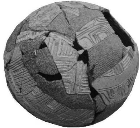
Fig.4: El Anatsui, We De Patch Am, 1978, stoneware terracotta (manganese body), dia. 40cm