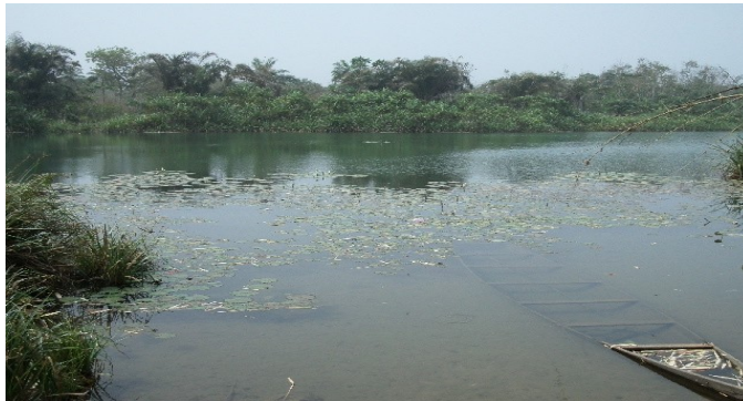
Figure 2: The Lake at Ezeagu Tourist Complex.

Site accidents which is rated high at Ezeagu Tourist Complex judging from frequency, magnitude and fatality, was equally applicable to some other sites studied. Tourists to these sites need extreme caution and proper guide while exploring these features at the site. Table 3 below gives more insight to the understanding of the nature of these threats at studied samples.