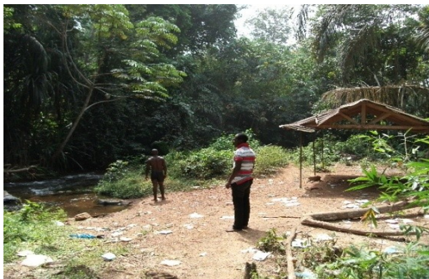
Figure 4: A local tour guide with a tourist at Ezeagu Tourist Complex.